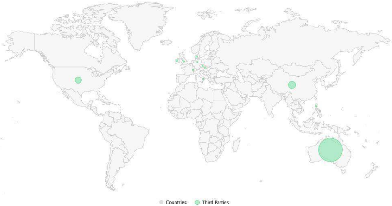
Supplier Business Operations

Of the suppliers subject to ‘enhanced due diligence’ (see section 0, item 2 for criteria), the majority were not reporting entities under the Act.